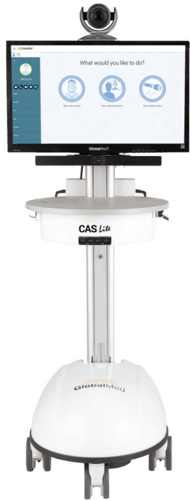
CAS Lite $1,164/ mo