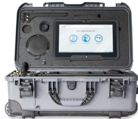
Transportable Exam Station $1,171/ mo