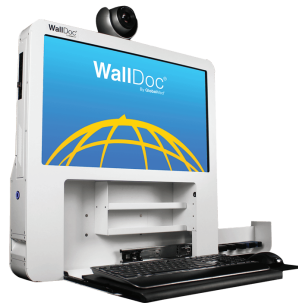
WallDoc® $1,267/ mo